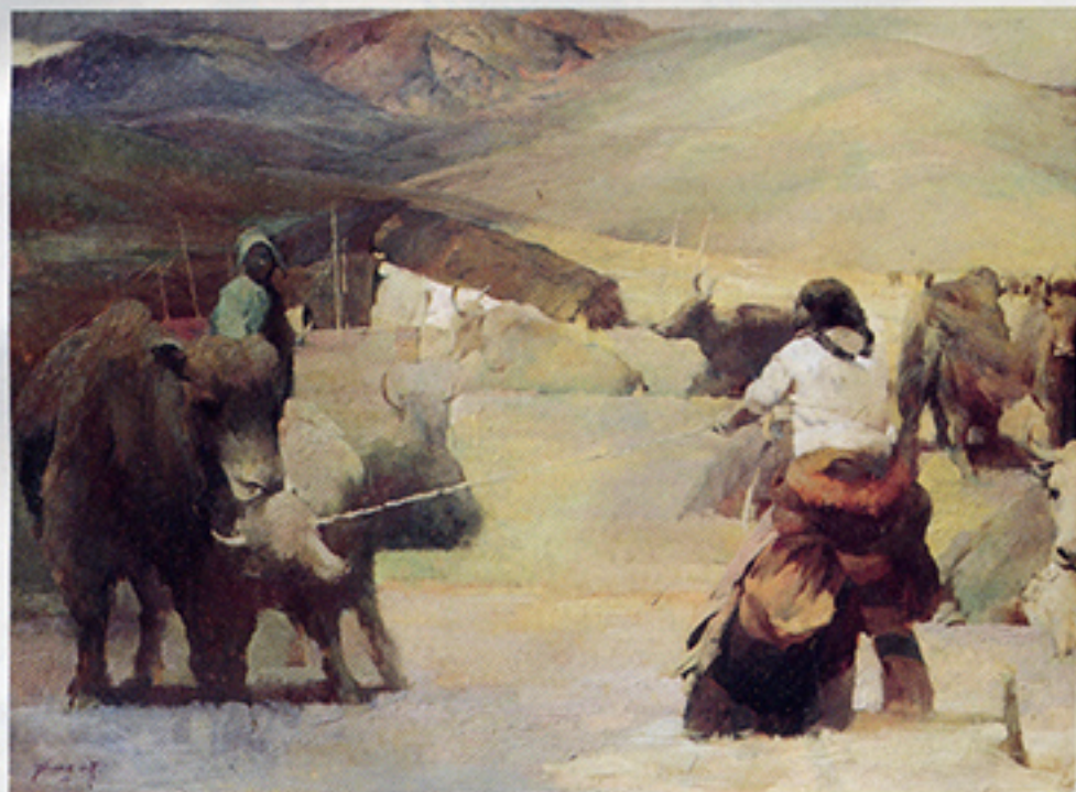
Creating with Complements

Zhang eschews detailed preliminary drawings on his canvas; his initial sketch is only for placement and proportion. Instead, his first goal is to cover the white surface as quickly as possible, using only tinted oil washes diluted with turpentine. He favors oil-primed linen for an "oil-on-oil" feeling, and he paints fat-over-lean. He usually follows the traditional dark-to-light approach, especially when a painting contains lots of darker colors.